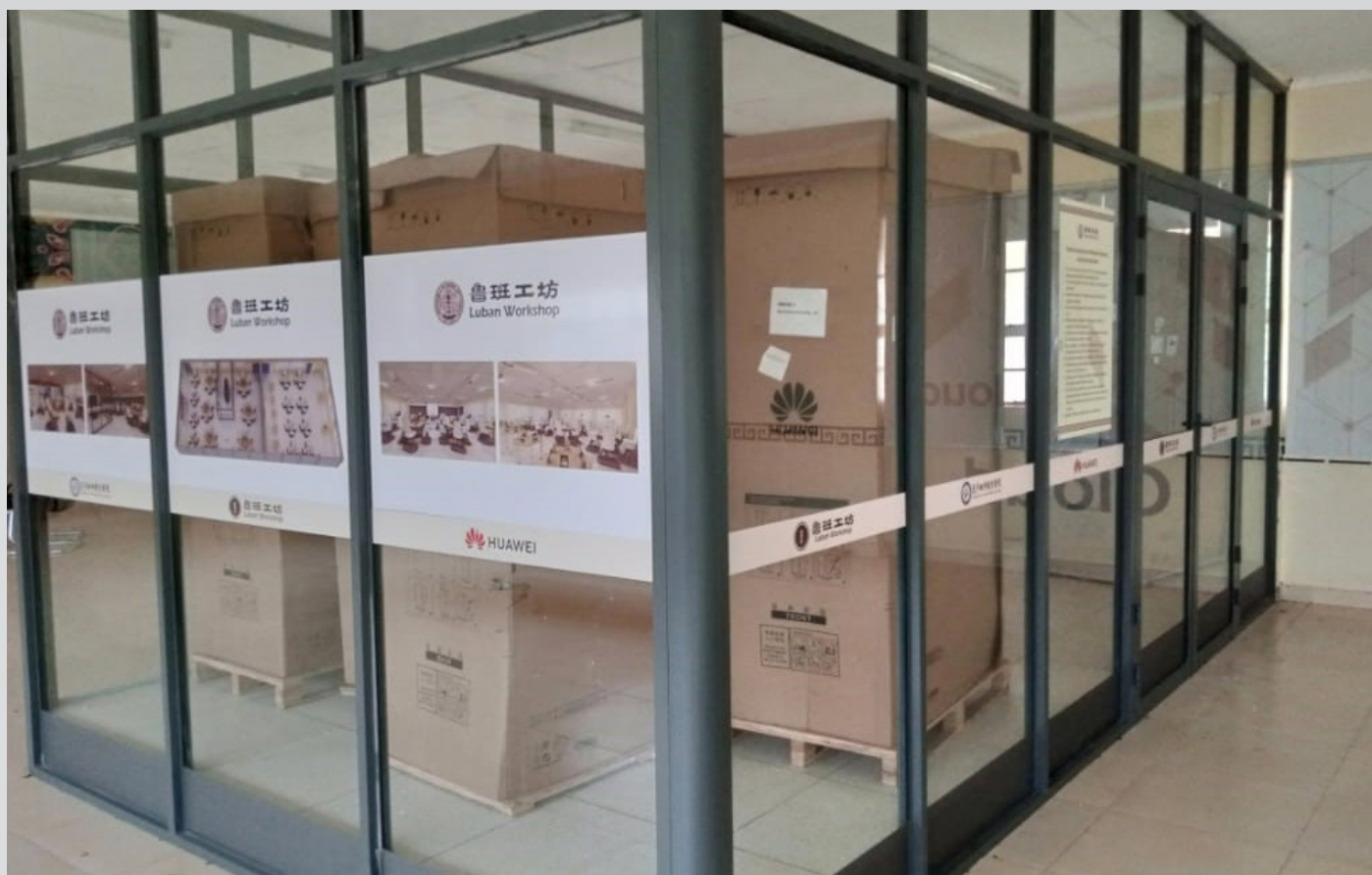
Part of the Equipment inside the Luban Workshop