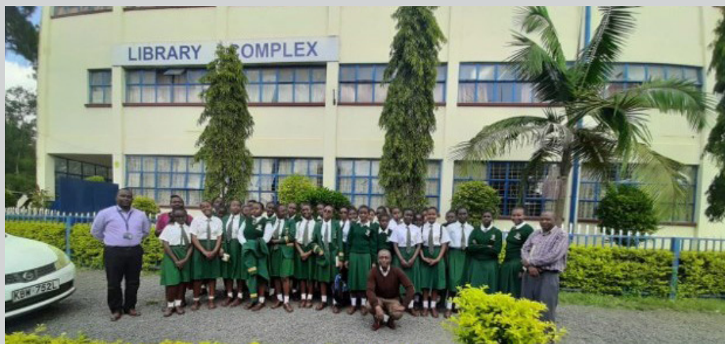
Matungulu Girls High School after visiting the library during the University Innovation Week and Open Day held on 24th to 28th February, 2020