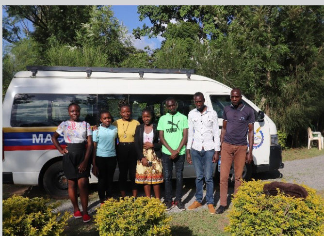
A section of Machakos University Students who participated in the celebrations on 7th March 2020