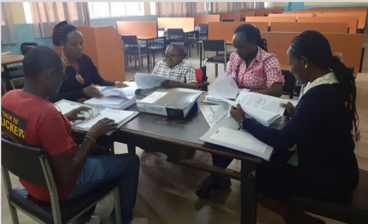
Staff members preparing for internal ISO Audit

Internal ISO Audit was conducted on 11th March, 2020. Internal audit is conducted every quarter of the financial year with an aim of enhancing service delivery in the library. Speaking during the opening meeting of internal audit held on 10th March, 2020 the Director University Quality Management System (QMS) indicated that internal audits were meant to prepare the university for external audit which is conducted twice in a financial year by the national standards certifying body; Kenya Bureau of Standards (KEBS). Internal auditors however lauded the library for not recording non-conformity during the exercise..