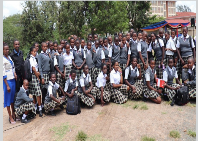
(Left) Students from Katoloni Secondary School take part in the procession. (Right) Students from Ikutha Girls Secondary School in a Group Photo