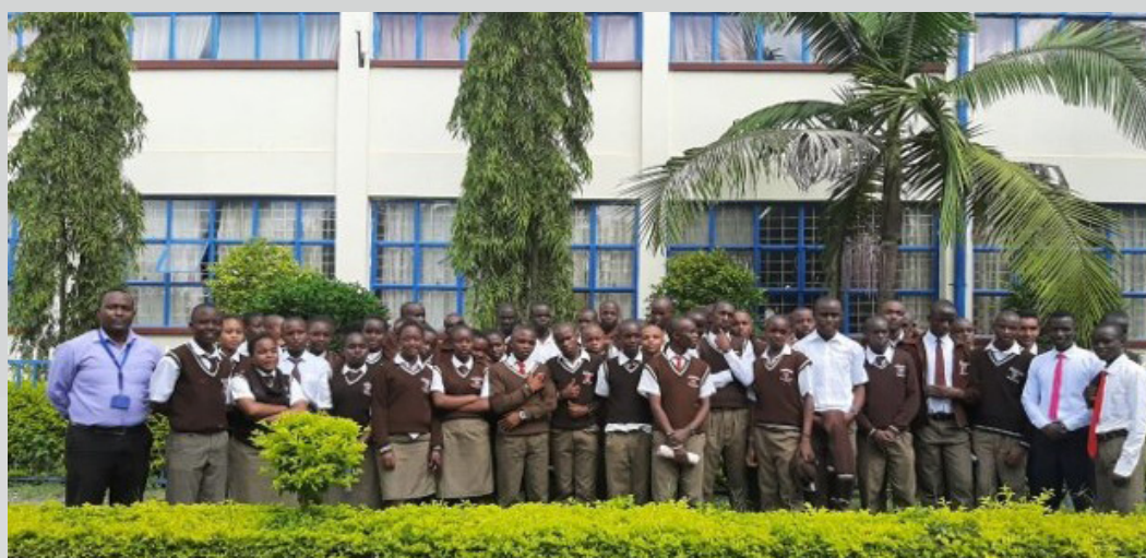
Katoloni High School after visiting the library during the University Innovation Week and Open Day held on 24th to 28th February, 2020