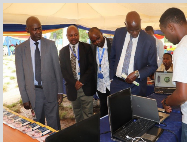
A cross -section of innovations

Apart from innovations, Machakos University academic programmes were also showcased. High school students and their career teachers from various schools toured the exhibitions and attended Open Day. They were taken through the career clinics for career and academic mentorship. In addition, the students given a tour of the University Library.