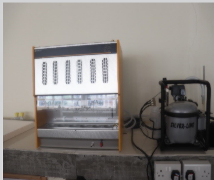
Soxtherm installed in the Science Laboratory