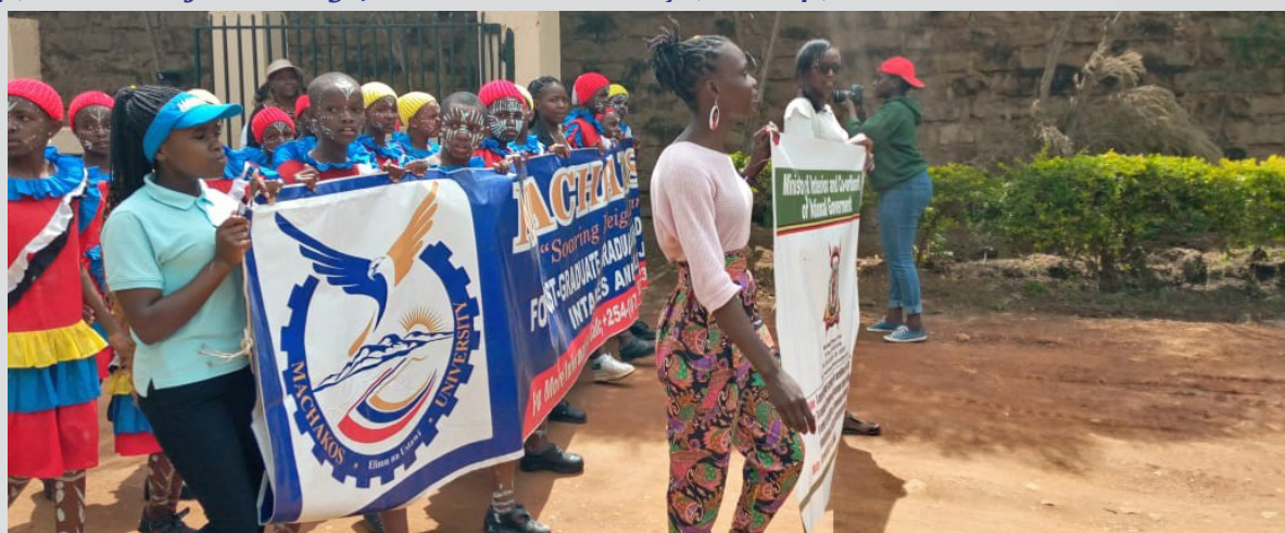
Pupils from Machakos School for the Deaf join in to carry Machakos University banner during the Procession in Machakos Town on 7th March 2020.