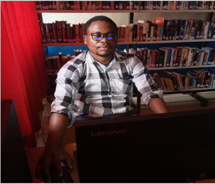
Systems Librarian conducts online training on Turnitin and Remotexs to postgraduate students

The library staff trained Forty (40) post graduate students on RemoteXs off campus e-access platform and Turnitin plagiarism software on Friday 29th May, 2020. Previously, the library has conducted face to face trainings for users. However, in her effort to curb the spread of covid-19 virus by promoting social distancing all trainings are to be conducted virtually.