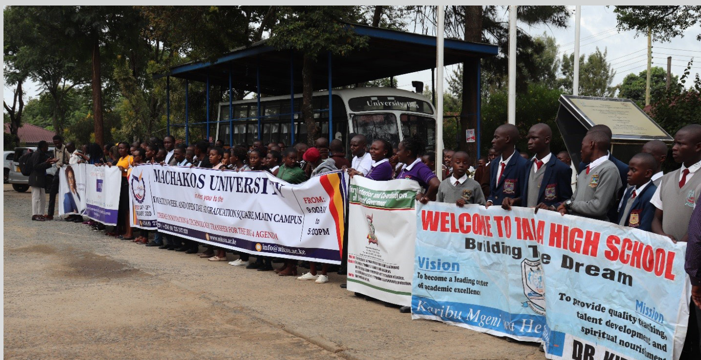
Participants getting to ready to staff the procession to mark the official opening of the Machakos University 2nd Innovation Week and Open Day