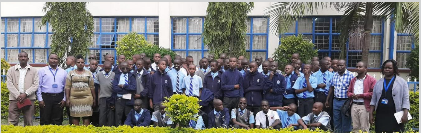
Students and teachers from Holy Ghost Secondary School in a group photo after visiting the University Library.