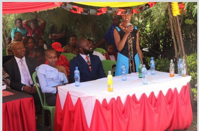
Machakos University Models adjudicating the beauty pageant during the celebrations on 7th march 2020.