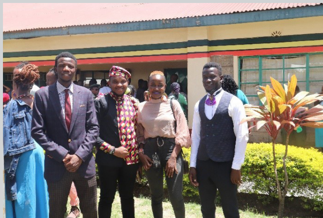
Machakos university Models during the celebrations. The models trained Machakos Women prison models, entertained participants and adjudicated beauty pageant