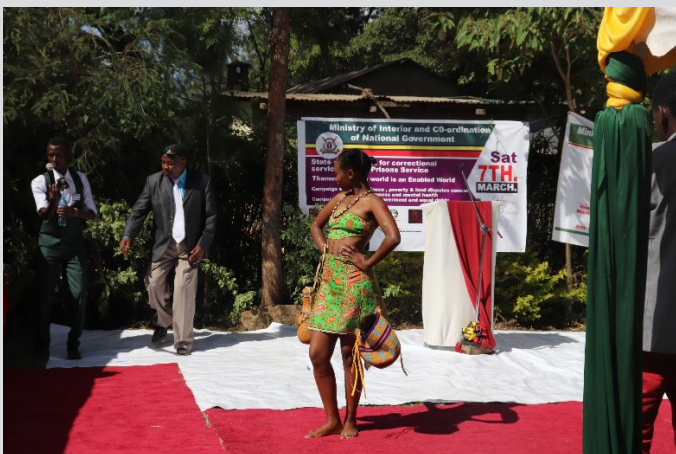
A model from Machakos University takes part in the beauty pageant on 7th March 2020. She won the first runners up position.