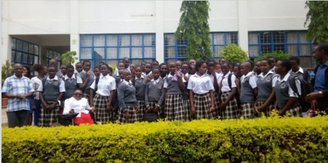
Ikutha Girls High school after visiting the library during the University Innovation Week and Open day held on 24th to 28th February, 2020