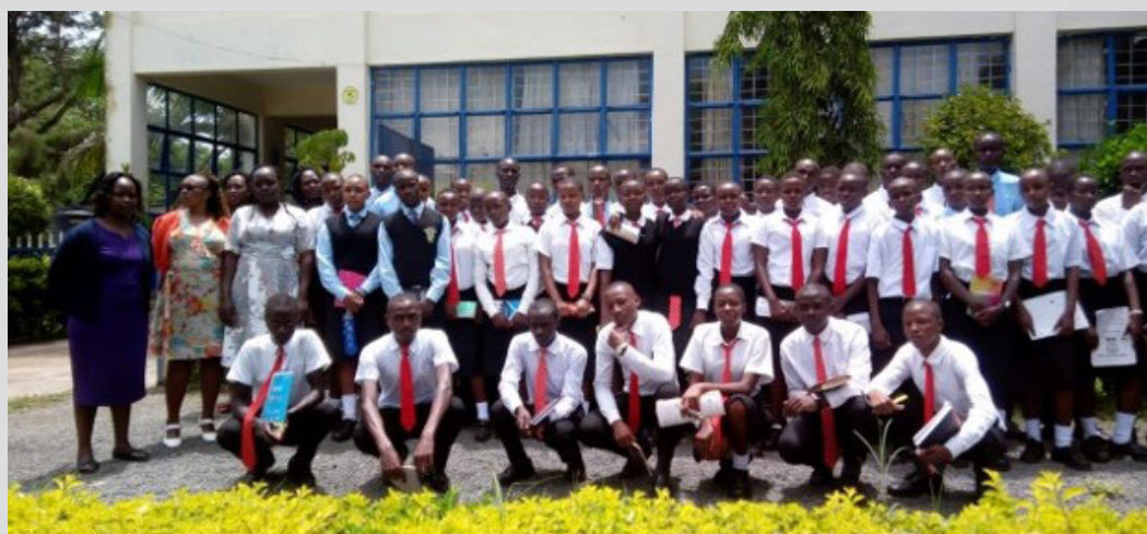
Wakaela High School after visiting the library during the University Innovation Week and Open day held on 24th to 28th February, 2020