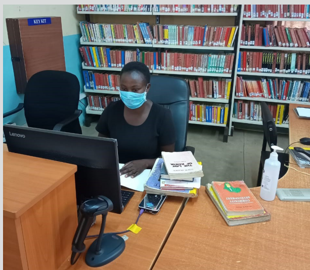
Library staff attends web conference training

Eleven (11) library staff were trained by ICT Directorate on Thursday 21st May, 2020. The training was aimed at sensitizing the members on the use of conferencing tools to host meetings and also to support e-learning initiatives in the institution. Speaking in her opening remarks of the training the Deputy Vice Chancellor- Academic and Student Affairs (ASA) emphasized on the need of the library to offer the necessary e-resource support to students remotely especially in the wake of covid-19 pandemic. In this regard, the library Information literacy training, orientation programmes and all user advisory services are offered online.