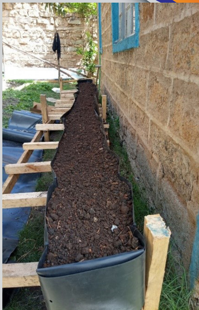
The maple garden ready for planting