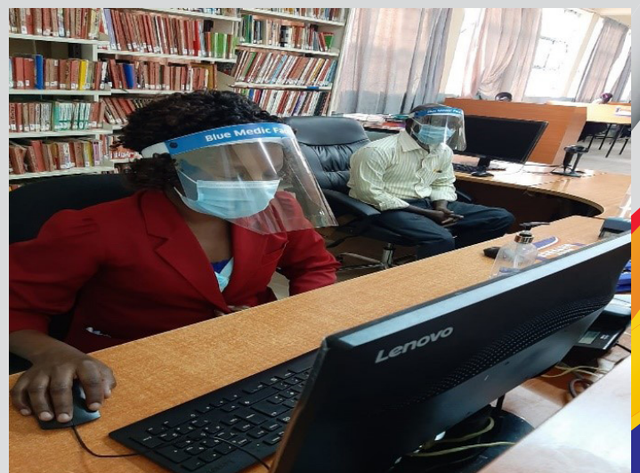
Library circulation desk staff donned in facemasks and shields