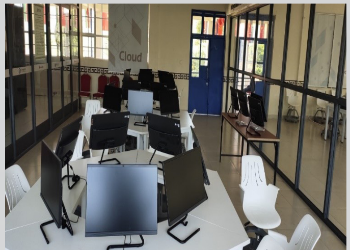
Big Data Analytics Sub-Section