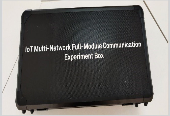
IoT Training Kit