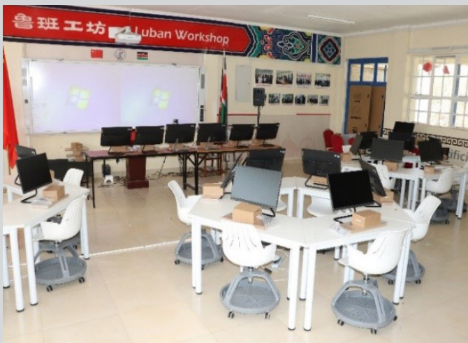
Don View and Video Conference Sub-Section

Machakos University in partnership with the Tianjin City Vocational College (TCVC) completed establishment of the Kenya Luban Workshop hosted at the Department of Computing and Information Technology (CIT) in the School of Engineering and Technology. The Luban Workshop at Machakos University, also known as a Cloud Computing and Information Security Training Centre, is a state-of-the-art facility that is unique in Kenya and the East African region. It has modern equipment for the most current technology and is ideal for training modern skills, research, Data Centre services and data recovery and backup services. The facility will therefore enhance training and quality of the programs and courses offered by the CIT Department, including: BSc. in Computer Science, BSc. in Information Technology, Huawei Certified ICT Associate (HCIA) in Cloud computing, Huawei Certified ICT Associate (HCIA) in Artificial Intelligence, Huawei Certified ICT Associate (HCIA) in Datacom, and the soon to be launched BSc in Cloud Computing and Information Security. The Center has sub-sections that deal with Big Data Analytics, Intelligent IoT Learning, Data Centre services and Server virtualization, Data Backup and restoration, Long-range Wireless Communication Technologies (including 3G, 4G and 5G Networks), Short-range wireless Communication Technologies and Block-Chain. The fully equipped sections of the Centre are shown below.