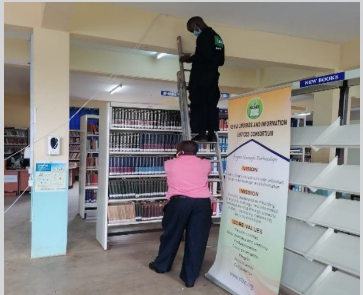
Suppliers installing intrusion control system in the library

In a bid to enhance security in the library, Machakos University installed an Intrusion Control System in the facility on 24th November, 2020. Speaking during the installation of the system, the Proprietor of Double Four Supplies indicated that the access control system is responsible for restricting and granting access to specific people into particular areas. The goal of the software is to minimize unauthorized access to places, assets, and systems. In her remarks, the University Librarian expressed optimism that the system would complement existing systems including the electronic security systems, CCTV cameras and human security personnel, to boost security of library users and human and information resources.