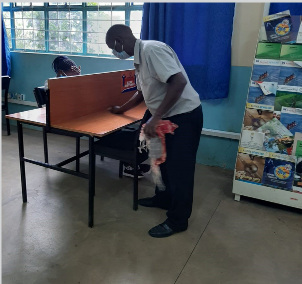
A worker sanitizing library surfaces after every three hours daily