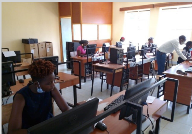
Students are taken through an ICT lesson