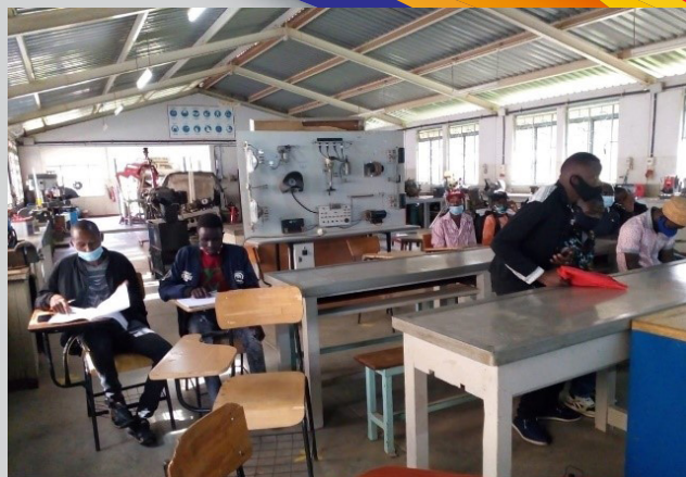
Students attending a Motor Vehicle Mechanics class