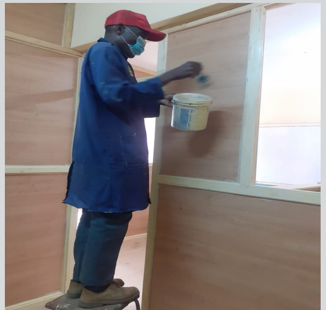
A worker painting partitioned librarian's office