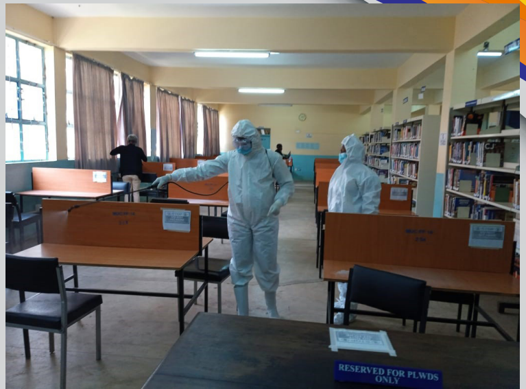
Fumigation process in progress