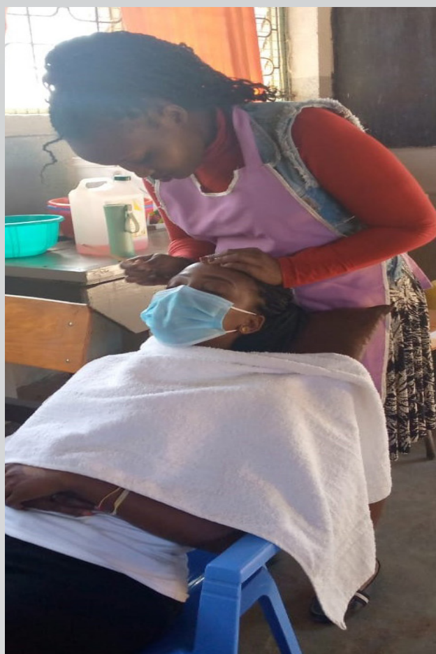
Hair and beauty Students practise facial treatment at the Cosmetology Workshop