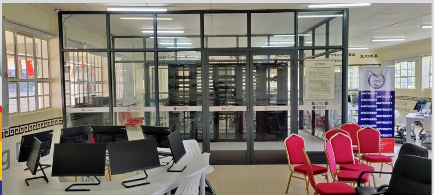
Cloud Computing Training Area