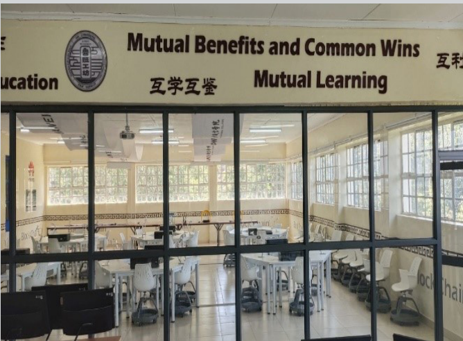
Seminar room and BlockChain Training Area