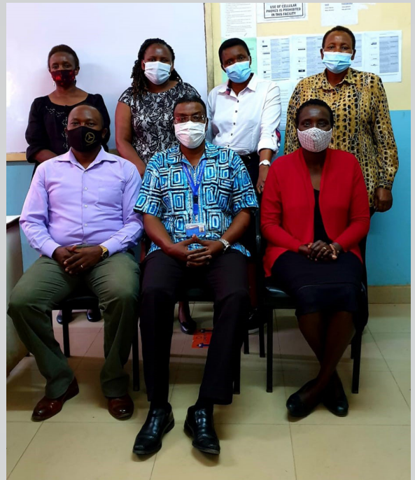
Deputy Librarian and lecturers from School of Humanities and Social Sciences, Department of Fashion Design and Marketing after the training

Machakos University gives high priority to and promotes integrity in academic and research work. To this end, the University Library has Turnitin anti-plagiarism software that tests documents such as student and staff projects, thesis and assignments for similarity index. To create awareness and build capacity among university staff and students, the Library held a Turnitin training on 18th November, 2020. Speaking during the training, the Deputy Librarian challenged members of academic staff to ensure that assignments and research works emanating from Machakos University were authentic enough to stand the test of the time. In this regard, the deputy Librarian further urged academic staff members to liaise with library staff to test for plagiarism of research and academic works conducted in the University.