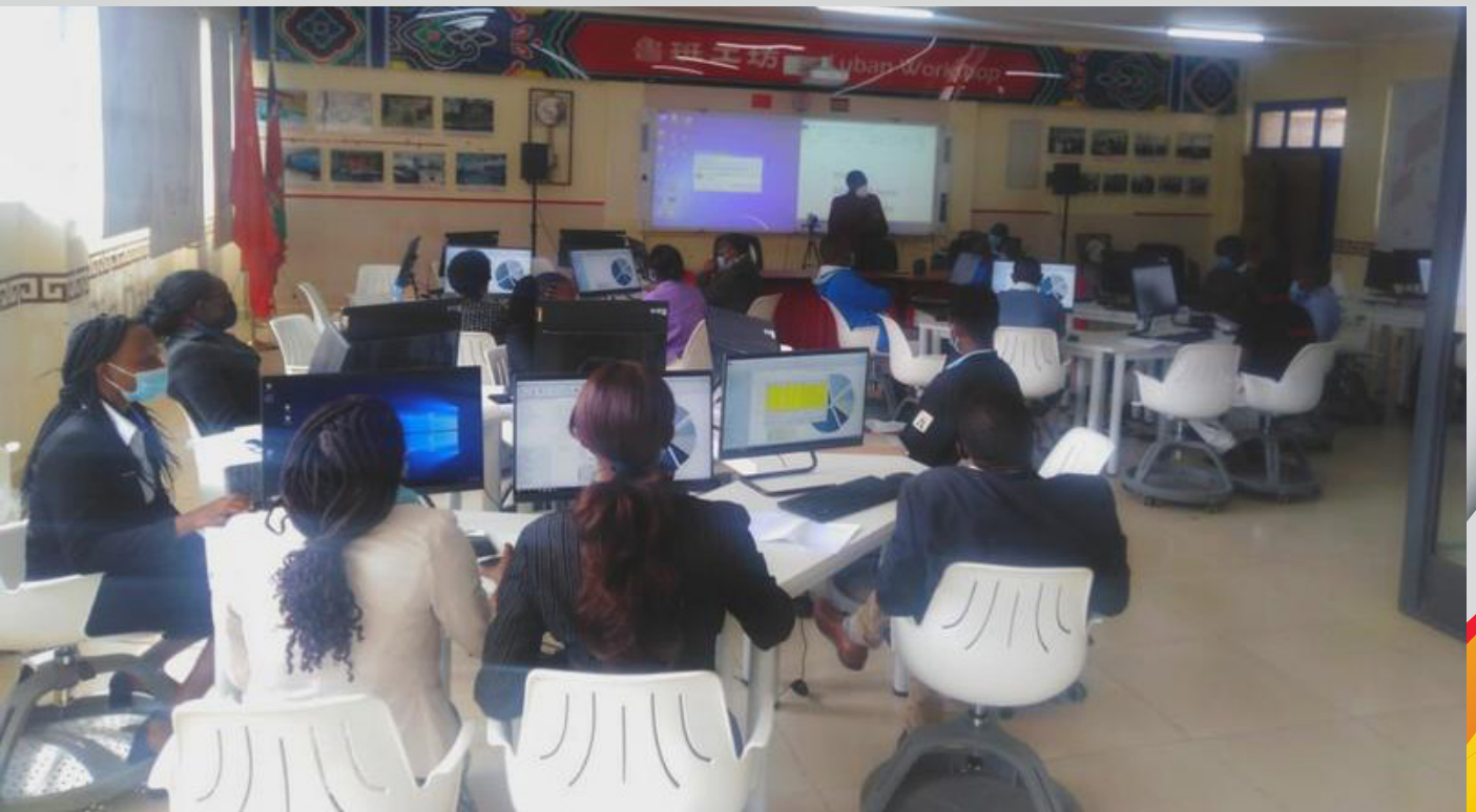
Staff from Machakos University and other institutions receive training on cloud computing at the Luban Workshop facilitated by Huawei