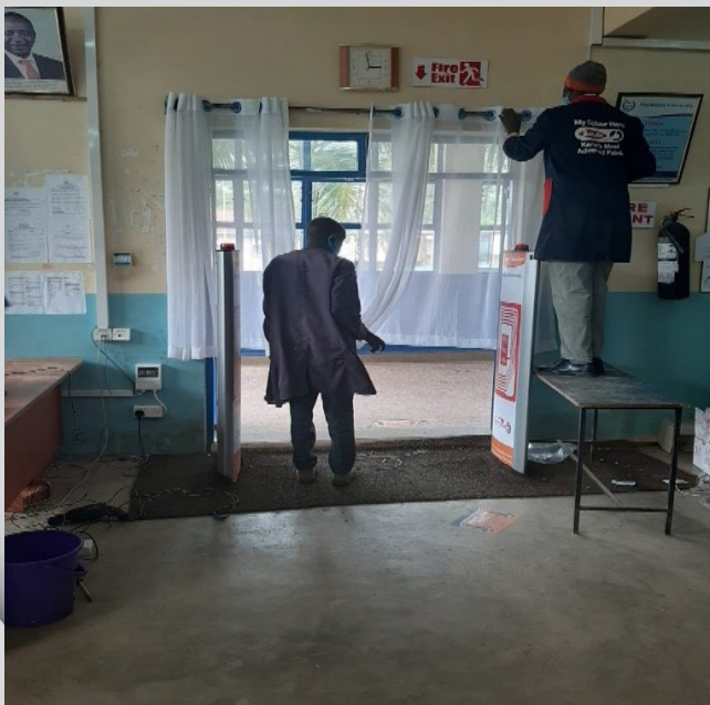
Workers fitting curtains and sheers on a library window

Libraries the world over have adopted modern designs that give staff and users more reasons to cherish their Libraries not only as reading facilities but also destinations for relaxation, discussions and hangouts. In light of this, MksU library has acquired and mounted new window curtains to improve aesthetics, increase warmth, as well as regulate natural light. In addition, partitioning of the University Librarians' office is in progress, which will enable the Library to comply with the requirements of the Commission for University Education (CUE).