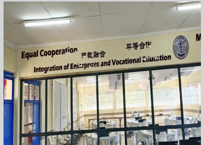
Entrepreneurship and Vocation Education Sub-Section