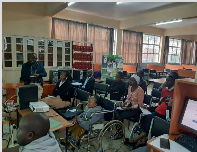
Library Staff Attending In-House Training