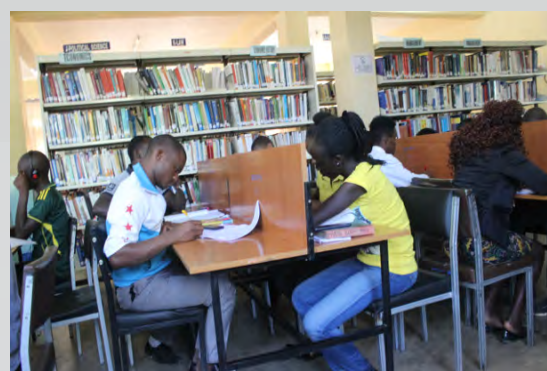
Students and members of the public studying in the library

The library allows members of public to access its resources. This is done by making a formal request to the Vice-Chancellor through the office of the Deputy Vice-Chancellor (Research, Innovation and Linkages). However, charges for such services apply and the application form for public users is available through the library website.