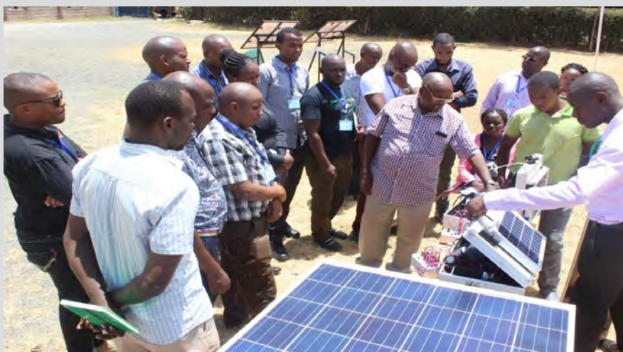
Participants follow keenly a demonstration on solar energy during a T3 Grid-Tie training on 11th April 2019

T he University has established the Centre for Renewable Energy (CREN) to harness the potential of green energy. The Centre is now conducting short courses and demonstration as a medium of transferring this technology to the society. Through this, Machakos University is now developing the much-needed human capacity (technical training) in the country, promote and advance innovation in the field of renewable energy technologies, as well as to generate and disseminate knowledge (awareness) and serves as a focal point for renewable energy projects.