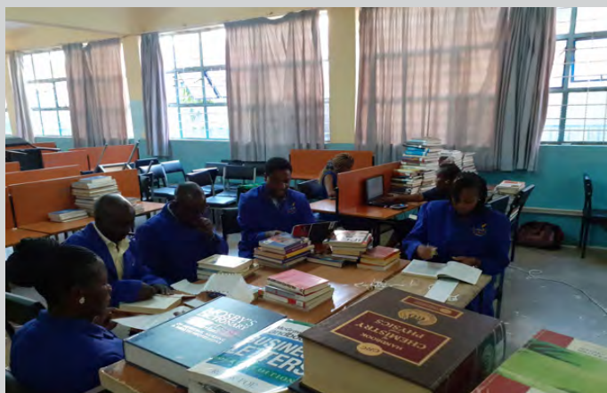
Library staff tagging books in preparation for intergration with the library security system

To safeguard the University books and other information resources, the Library boasts of installation of an electronic security system.