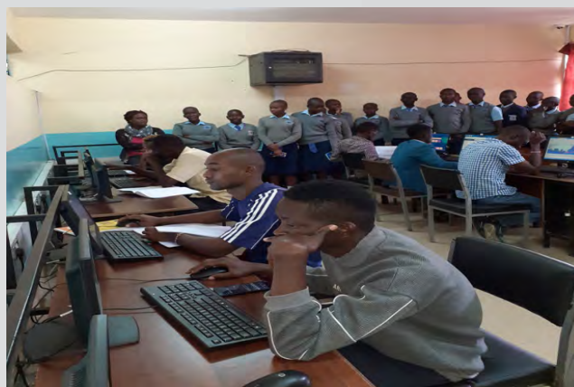
Fr. Makewa High School during the library visit