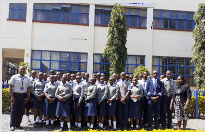
Fr. Makewa High School outside the library

As part of open access initiatives, the library staff also conducts Information Literacy training sessions for users. This has yielded results since usage of resources has increased tremendously. The faculty is expected to offer guidance to students on academic integrity, standards and policies that guide quality academic writing. Further the Library engaged community service initiatives, by hosting several secondary and primary schools. Visitations create avenues for mentorship and linkage with institution's stakeholders.