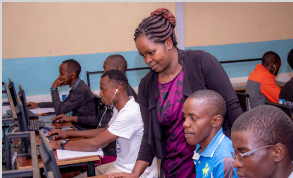
The Librarian training students on how to use the Institutional Repository and RemoteXs Off Campus Access

The Library Embraces RemoteX to Increase Access to Its Resources: the provision of relevant and up to date services to users' form a part of core mandate of research and academic libraries. In this vein, the University has procured an e- resource off campus access RemoteX Software that promotes usage of e-resources. Library users can conduct their research activities remotely and disseminate the findings through the institutional repository