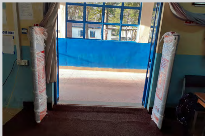
Library Electronic system