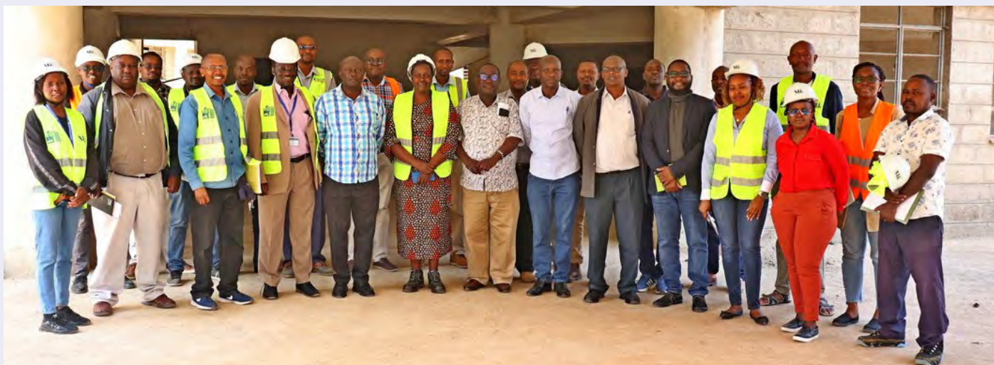
The Vice-Chancellor (Center) together with representatives from Machakos University Management, Contractors and the Consultant team

The Vice Chancellor expressed optimism that by early next year, the first phase of staff will be relocated and begin operations in the new Administration block. A partial handover of the building is expected to take place in December 2024, with the immediate focus on completing the administration wing.