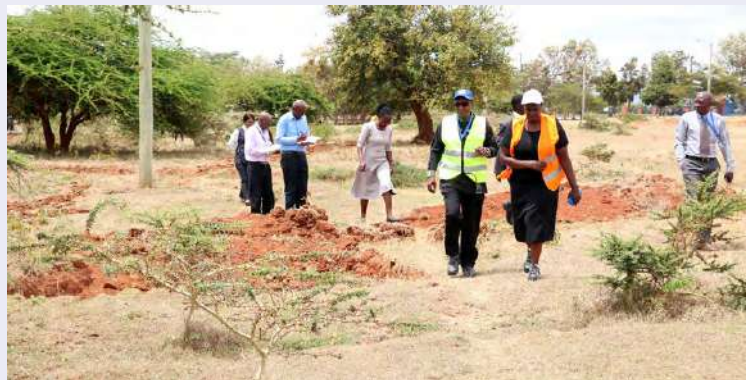
Members of the University touring the site, led by the Vice Chancellor