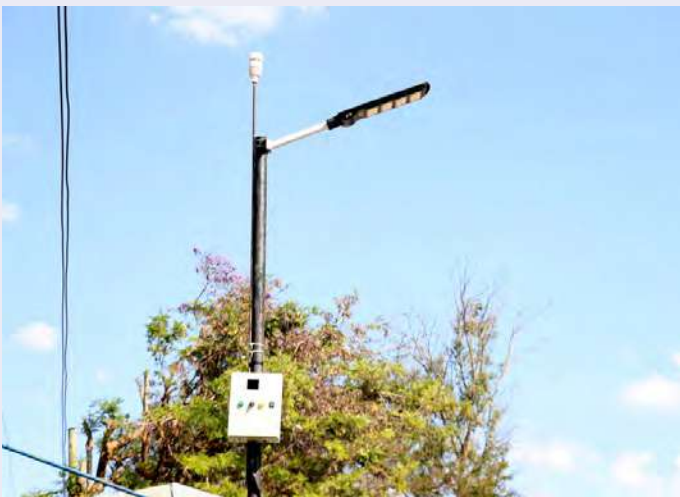
The climate and air monitoring equipment

The instruments are equipped with advanced features designed to monitor a wide range of air pollutants, enabling comprehensive evaluation of atmospheric conditions in comparison to clean air standards and historical data. Additionally, they measure climate variables and other environmental parameters contributing to sustainable development and environmental conservation efforts in the region.