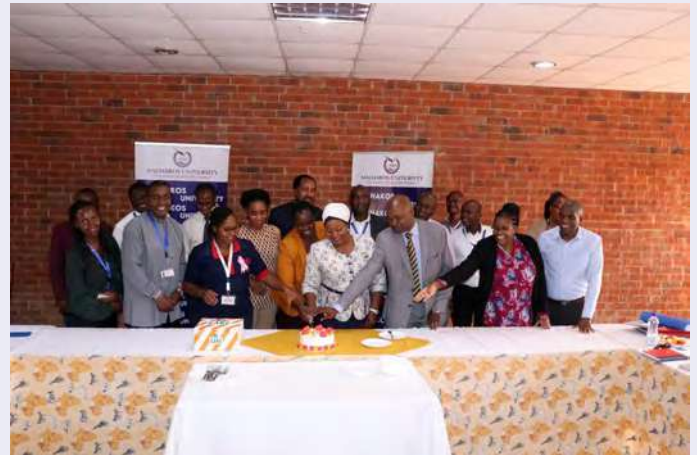
Members ceremoniously cutting the cake