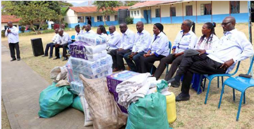
Machakos University UASU Officials & Staff presenting their gifts

As the day concluded, participants left with cherished memories and a renewed sense of purpose, reminding everyone of the power of kindness and community. Machakos University continues to inspire hope and joy, and we extend our heartfelt gratitude to all those that were involved in this meaningful outreach. May their efforts be blessed as they strive to create a more inclusive and compassionate world.