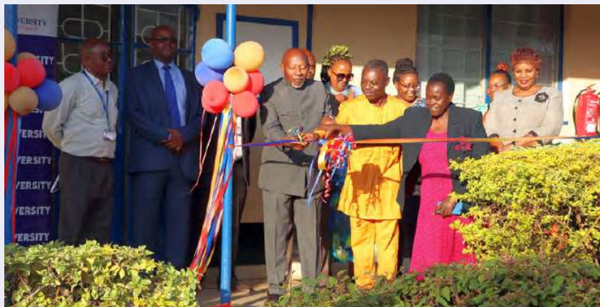
Ribbon-cutting ceremony and official launch of the new equipment