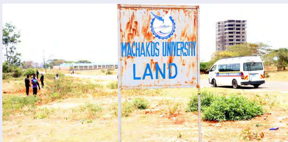
The Allocated Land at Mua Ward

These new facilities are set to enhance the