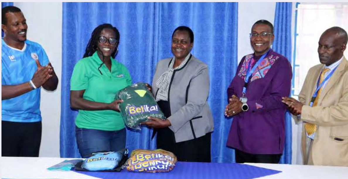
Sports Connect Africa Donates Football Kits to Machakos University