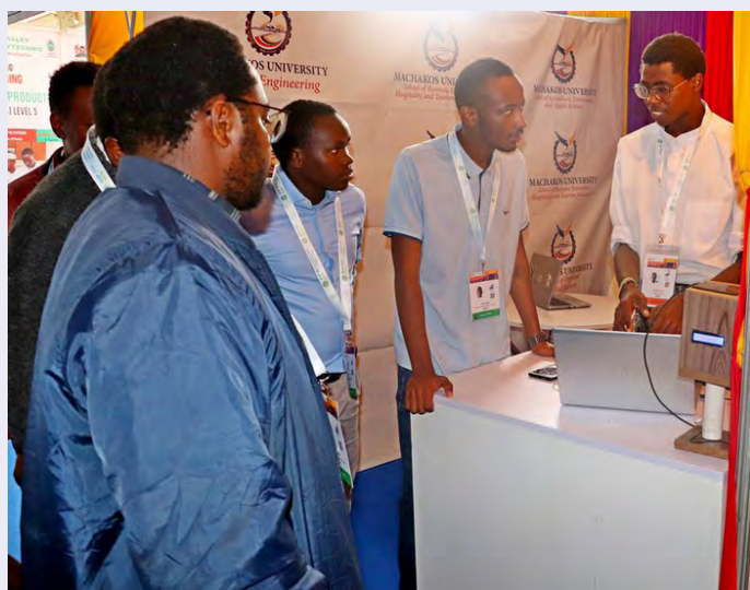
MKsU student demonstrating the Robox Farm Innovation