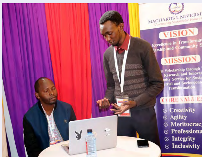
MKsU student demonstrating the Blind Eye Innovation

From Wednesday 25 th to Friday 27 th September, 2024 the Conference was held at the Kenyatta International Convention Centre (KICC) where more innovations were displayed.