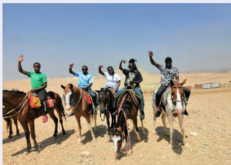
The students having fun in Cairo, Egypt during Visa application to Latvia.