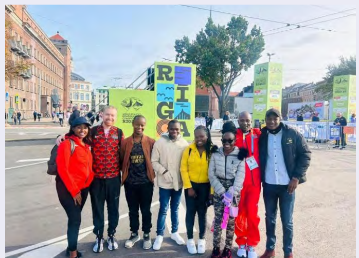
The students with their friends at RTU during the Riga Mathon, Latvia on 1st October, 2023