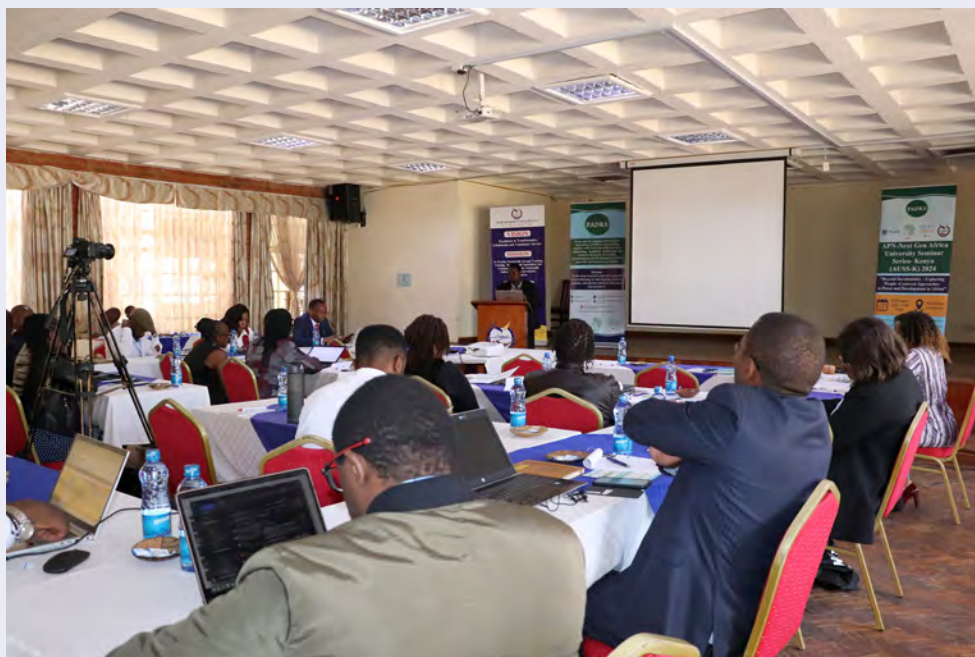
Ongoing Seminar session hosted at one of the Conference rooms at Machakos University Hotel and Conference Center