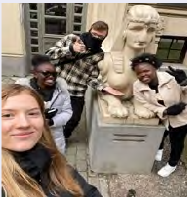
The Students and their friends at RTU